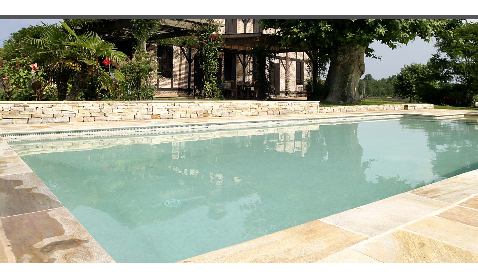
2514-B, from the mix collection, are colour blends from the Niebla and Lisa collections specially designed for cladding interiors, swimming pools, spas, saunas and wellness spaces. The most exquisite combinations.