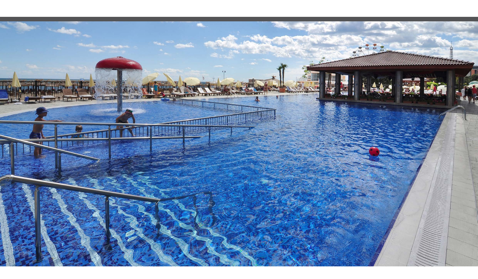
2577-C, from the mix collection, are colour blends from the Niebla and Lisa collections specially designed for cladding interiors, swimming pools, spas, saunas and wellness spaces. The most exquisite combinations.