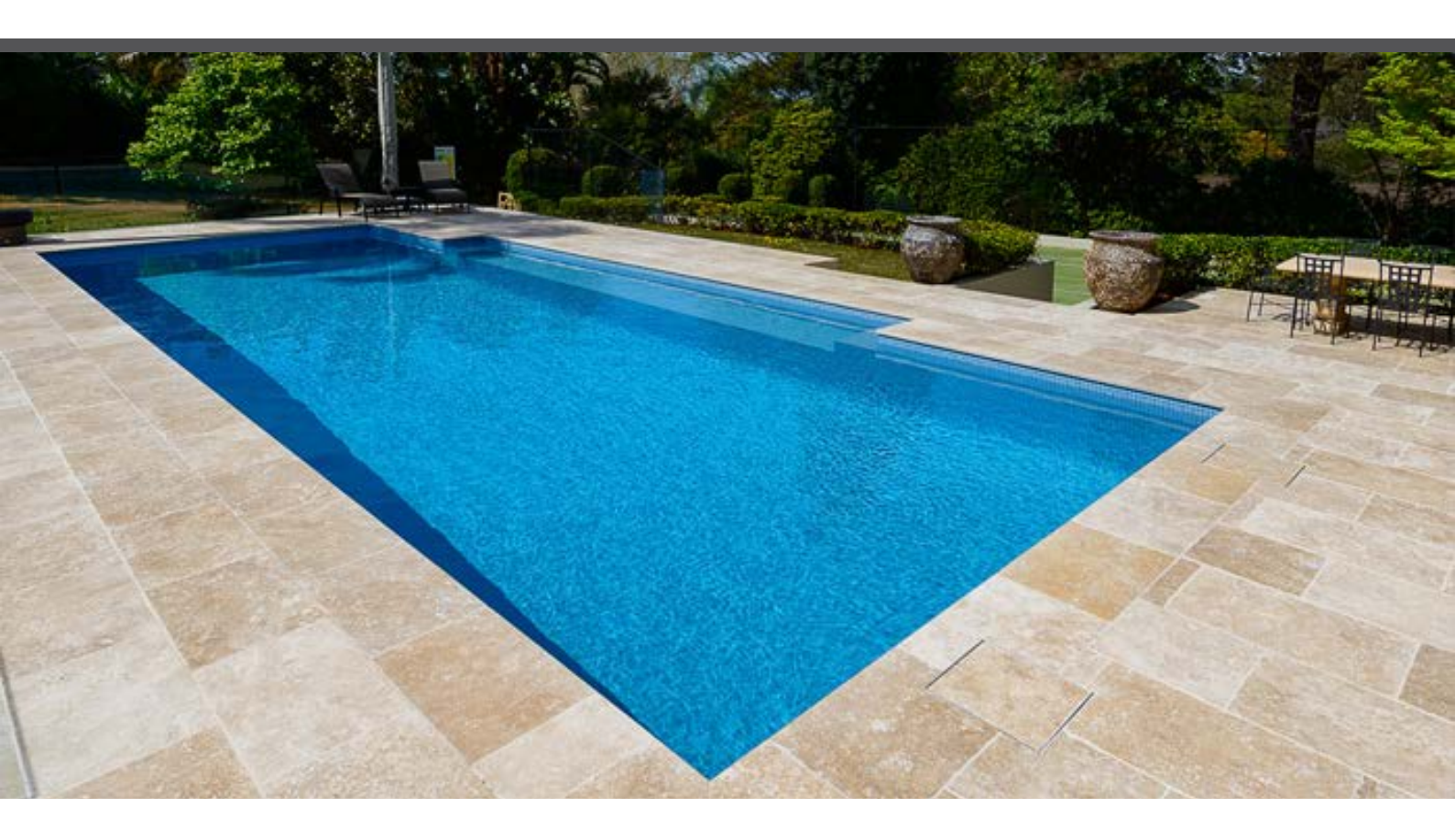
2520-A, from the Niebla collection, is a mosaic in hazy colours specially designed for cladding interiors, swimming pools, spas, saunas and wellness spaces.