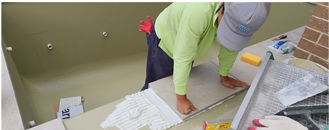
Image 6 - Firmly applying back buttered tile onto notched substrate.