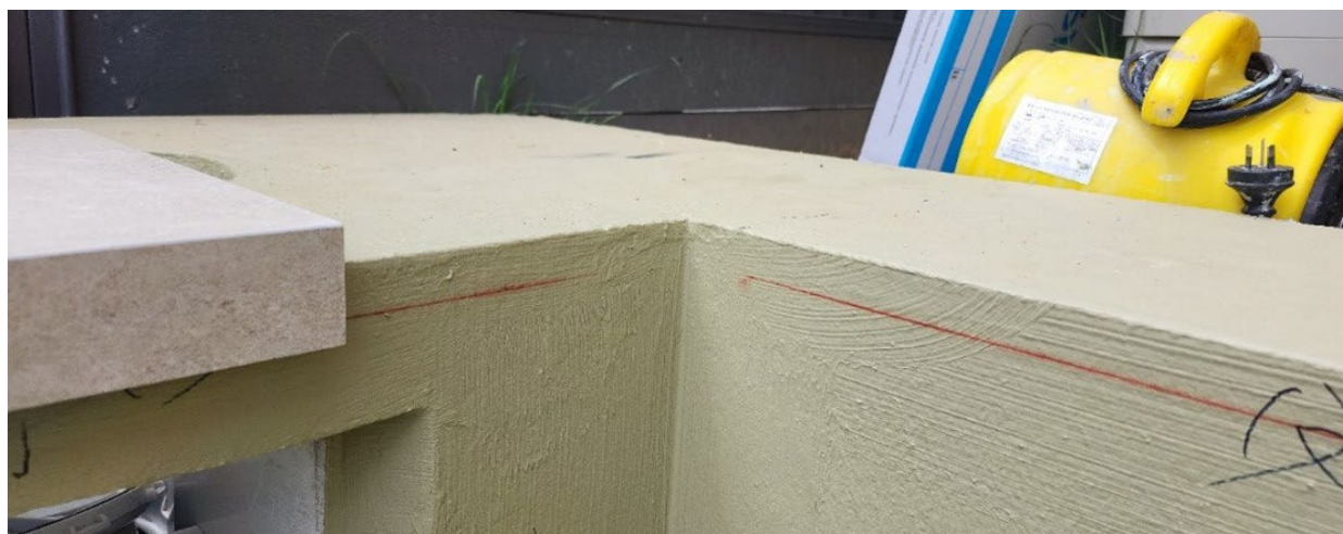
Image 3 - Appropriately designed and prepared substrate (including waterproofing system) ready for tile application.