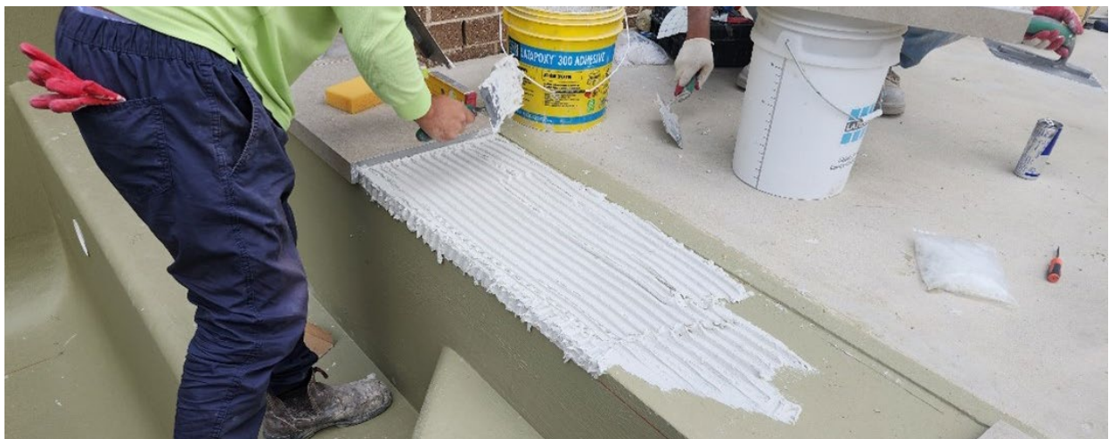
Image 5 - Applying adhesive to both horizontal and vertical areas of substrate using a notched trowel.