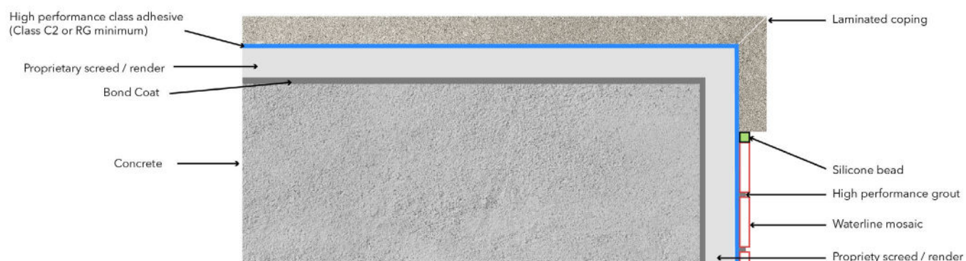
Image 2 - Laminated coping installation over propriety screed and render