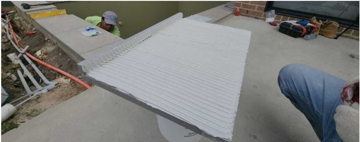
Image 4 - Back buttering 100% of the tile prior to installing onto substrate.